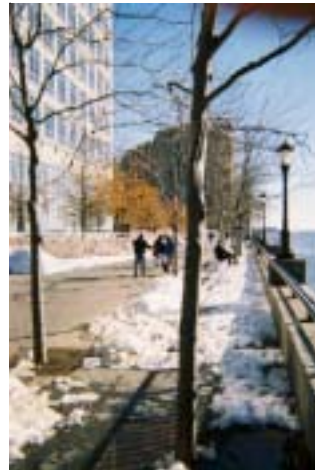
A walk along the Hudson River

The open agenda for the first day of the weekend allowed us to explore the financial district for places of interest, and some of us decided to spend time at the World Financial Center (WFC) plaza, defrosting with some hot chocolate and coffee. Overlooking the New York harbor, the soaring glass-enclosed WFC Winter Garden is home to the arts & events program, which is an innovative year round series of free performances, exhibitions, and cultural festivals. There are numerous shops and services that cater to the thousands of patrons who either work or visit the