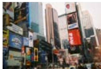
Looking down a busy NYC street near Times Square