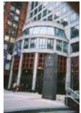
Stern School of Business