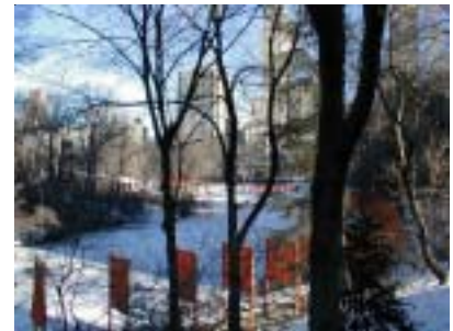
"Flags" art exhibit at Central Park

exchange has its challenges, and the fickleness of the market makes it all the more interesting.