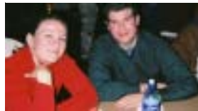
Students take a little break to warm up a bit!