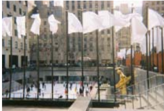
Ice skating at the Rockefeller in March!