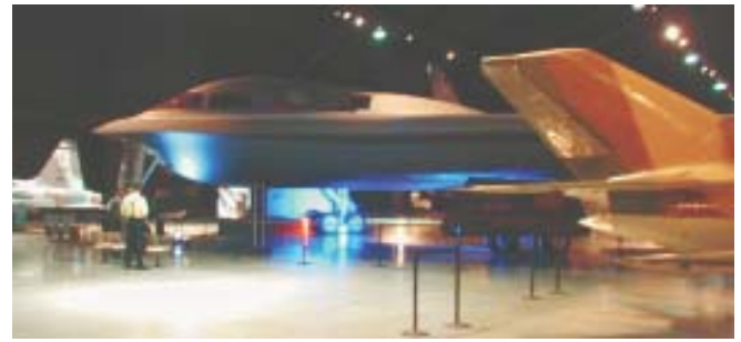
Imagine encountering this one starry evening!

The second day consisted of breakout sessions which tailored to each participant's areas of interest. The