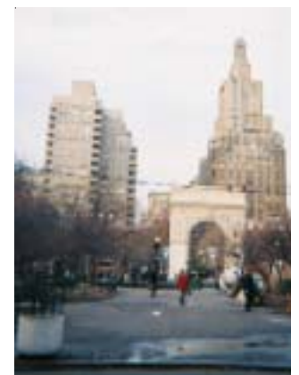
Washington Square refurbished