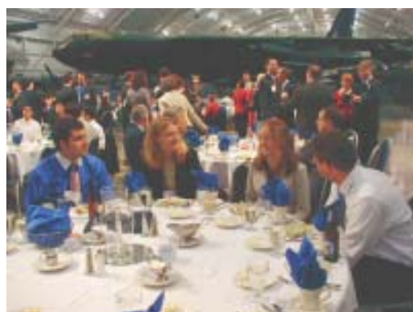
Our R.I.S.E. team finally has a chance to relax a bit.