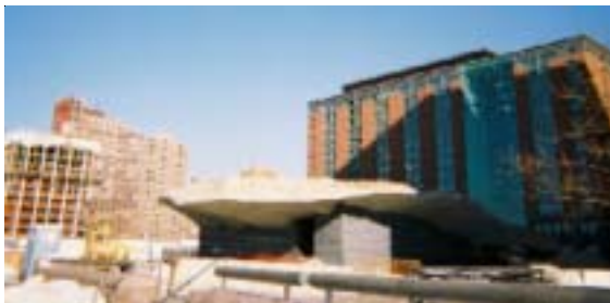
Reconstruction at Ground Zero continues