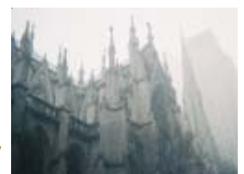
Spires of St. Patrick's Cathedral during snow storm!